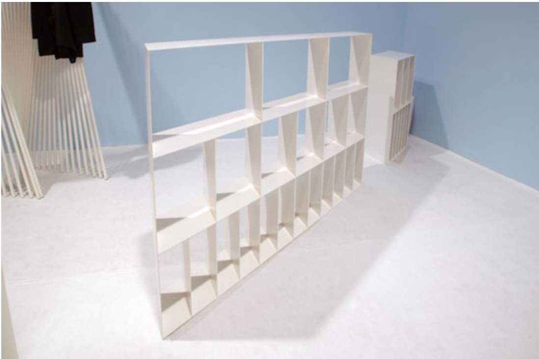
'section' image