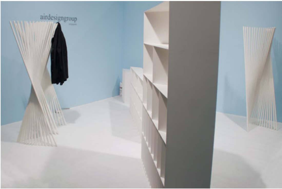
'beats' (clothing rack) and 'section' (shelf)