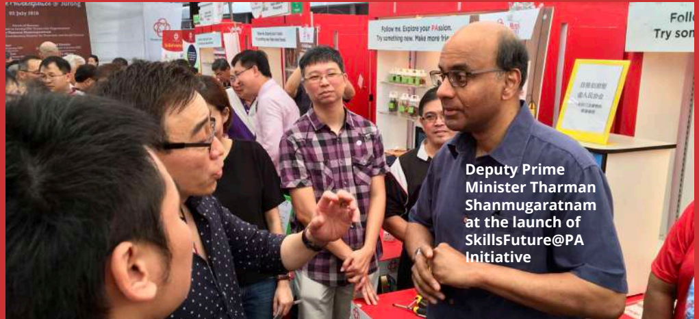
Deputy Prime Minister Tharman Shanmugaratnam at the launch of SkillsFuture@PA Initiative

Since its incorporation in 2010, the Institute has been helping the Singapore's furniture industry develop its human capital through a holistic range of training programmes and initiatives.