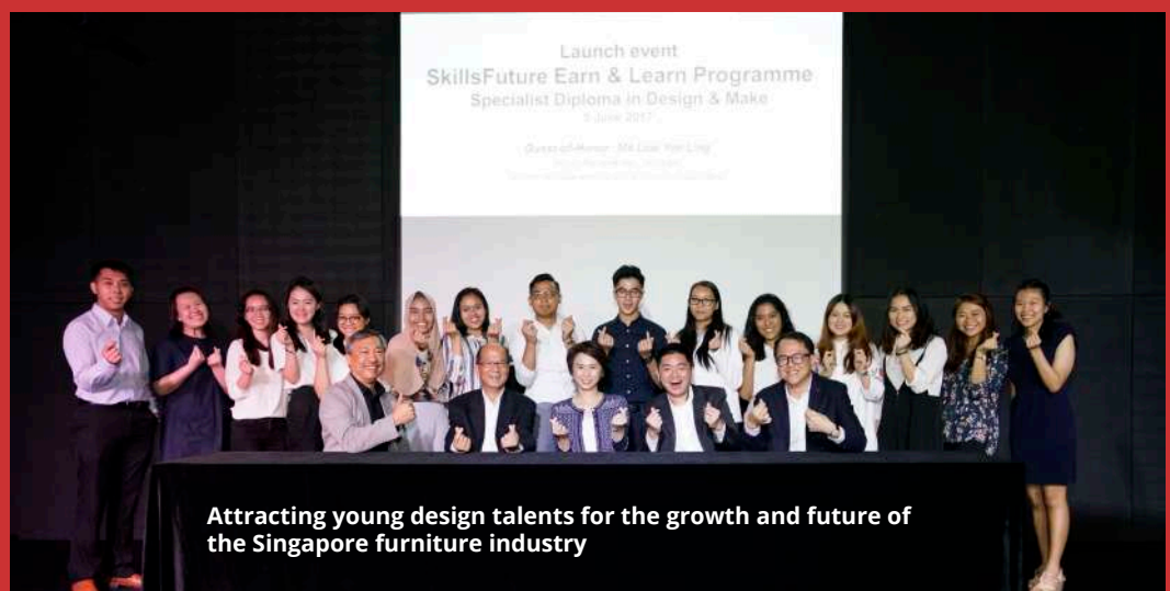
Attracting young design talents for the growth and future of the Singapore furniture industry

Participants of the NYP Specialist Diploma in Design & Make will gain more in-depth knowledge about the various aspects of furniture and furnishings design industry and also learn about the practical aspect of furniture design industry, for example, the latest materials, construction and production methods. In addition, they will hone skills in client management, business development and marketing capabilities through on-the-job training. The programme complements the current courses provided in industrial, product, interior and experience design.