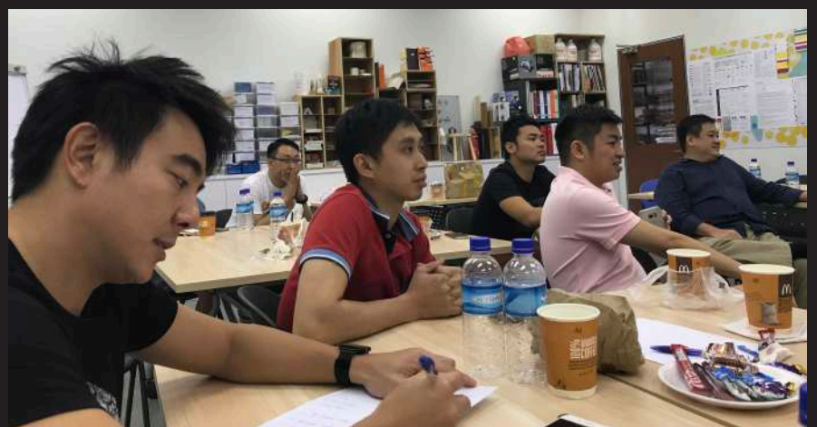
Bringing new ideas and a fresh perspective to the table

With the changing demographic landscape and the rise of the millennials in the workforce and as a powerful consumer group, efforts are being stepped up to nurture younger members to sustain the association's growth and relevance. YFC provides its NEXT-GEN industry leaders with a holistic experience through a wide range of events and activities to encourage experience-sharing, business networking, and community cohesiveness, both locally and regionally.