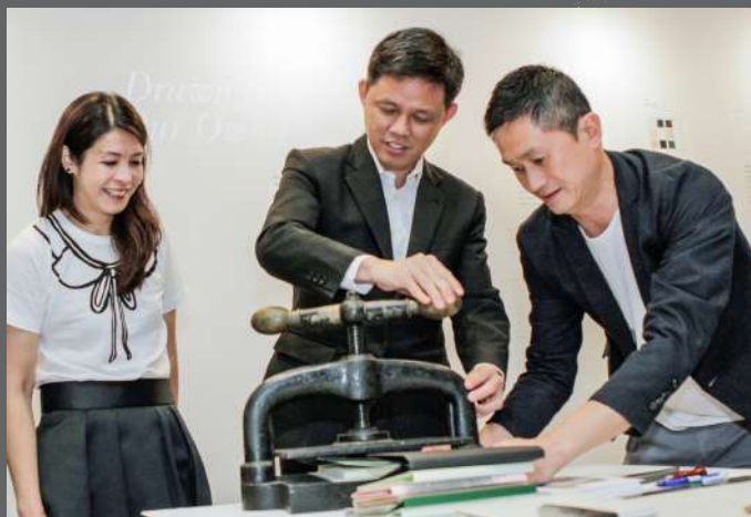
Left: Minister Mr Chan Chun Sing giving book binding a go at the Bynd Artisan installation at SingaPlural 2017