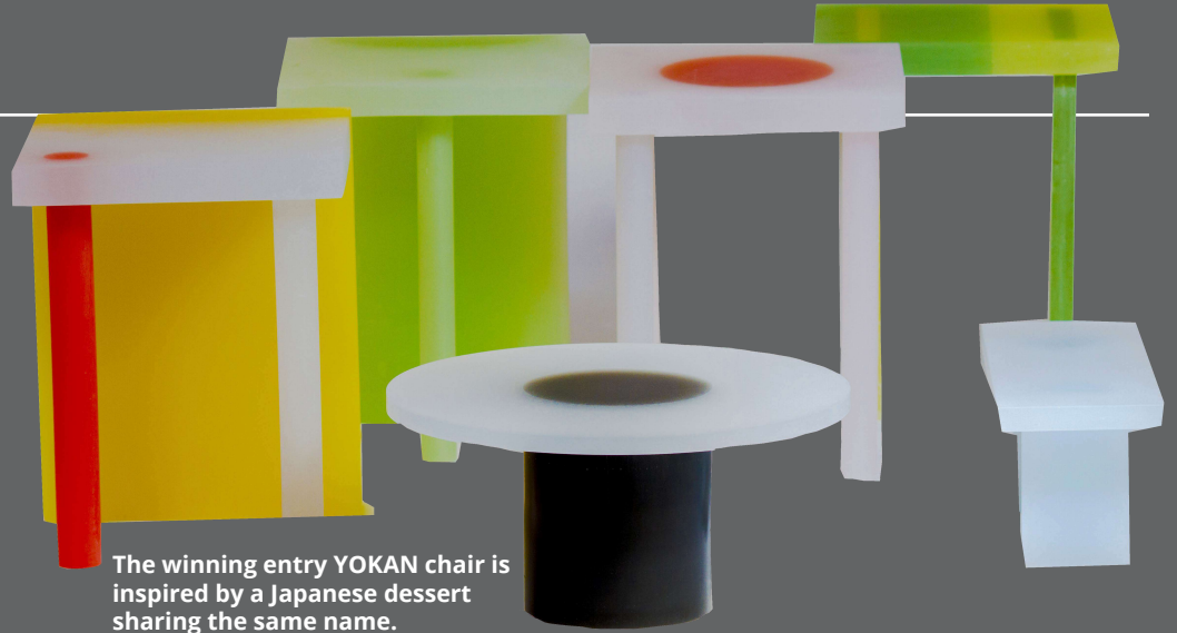
The winning entry YOKAN chair is inspired by a Japanese dessert sharing the same name.