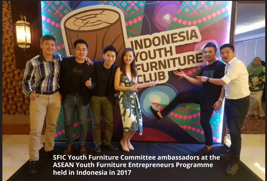
SFIC Youth Furniture Committee ambassadors at the ASEAN Youth Furniture Entrepreneurs Programme held in Indonesia in 2017

Formed since 1999, SFIC's Youth Furniture Committee (YFC) comprises of the second echelon generation of industry leaders not more than the age of 40. YFC is borne out of a leadership succession plan put in place by SFIC to steer the future growth of the Council. In fact, more than 90% of the current Executive Committee members were part of the YFC.