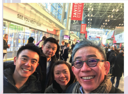
Commune & Star Furniture senior management joined the New York Retail Trip to learn about the latest best retail practices and technologies.

The NRF Retail BIG Show, with its three-day business conference, offered a mix of education, networking and technological showcase for the retail industry and have attracted participation from industry practitioners worldwide. Local firms such as Star Furniture and Commune were part of the entourage that benefitted from the experience.